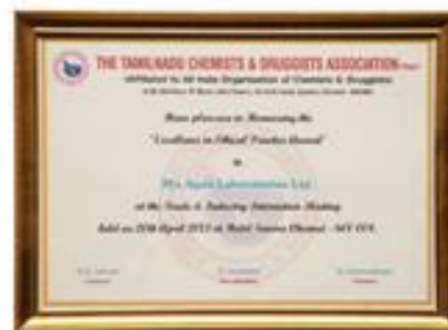
TNCDA Excellence in Ethical Practice Award