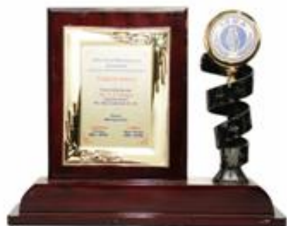
IDMA Plaque of Honour