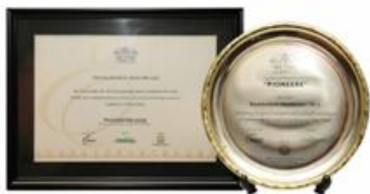
Excellence in Healthcare by The Times Group