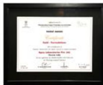
Pharmexcil Patent Award - Gold (Formulations)