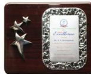
TNPSWT Award of Excellence