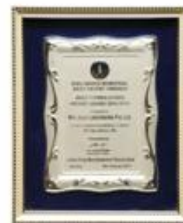
IDMA MARGI MEMORIAL Best Patent Awards (Formulations)