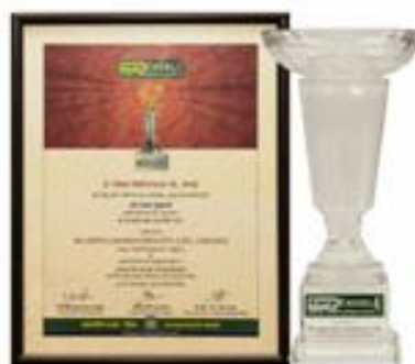
Corp Excel Award Award for Business Excellence under SME Category