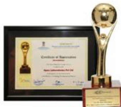
Pharmexcil Certificate of Appreciation (Formulations)